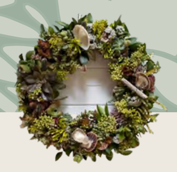
Festive Wreath R650