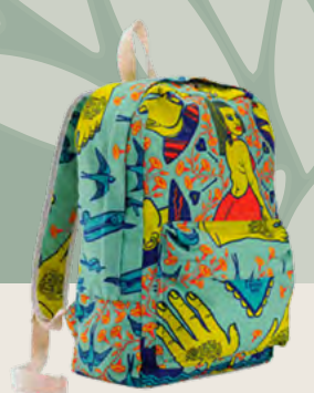
Shine Shine Backpack R800