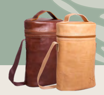
Thandana Leather Wine Cooler Double Carry Bag R999