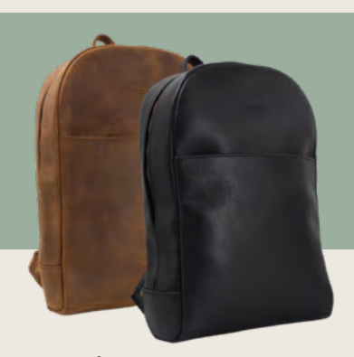
Premium Leather Laptop Backpack R2499