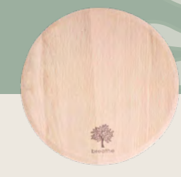
Round Oak Cheese Board R450